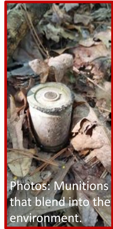
Photos: Munitions that blend into the environment.